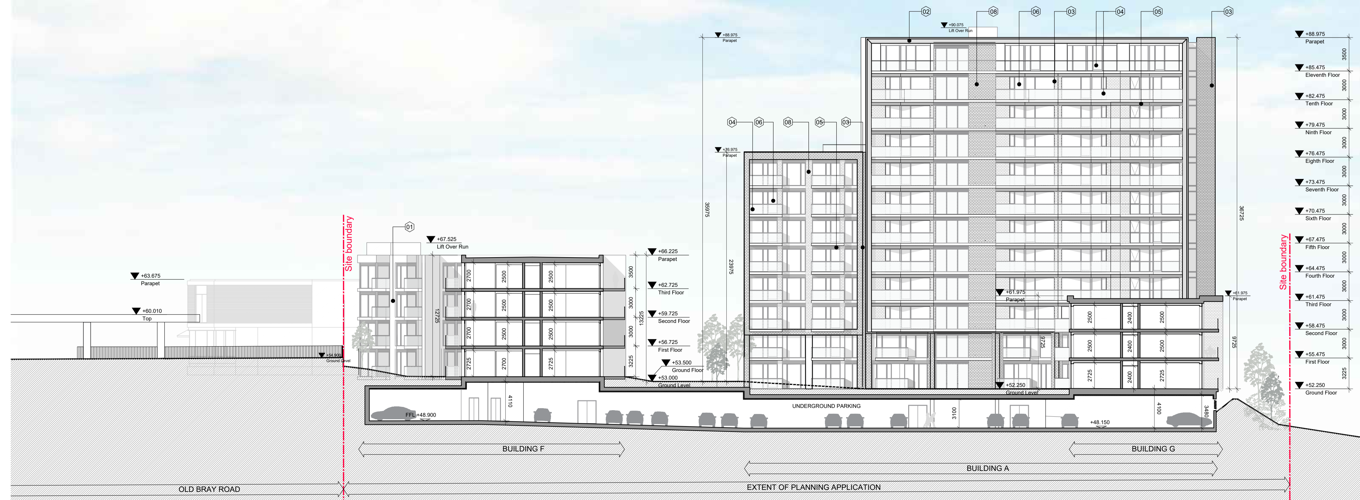
02 PROPOSED EAST ELEVATION 03 SCALE 1:200